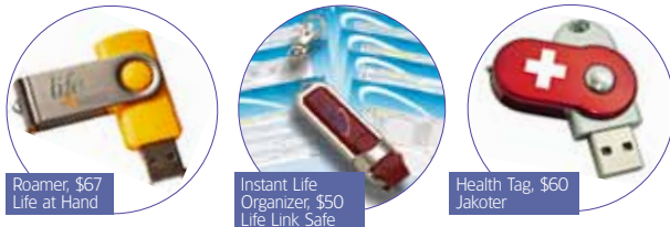
Roamer, $67 Life at Hand

If you love technology and are comfortable with password-based security on websites such as myyahoo.com or facebook.com , chances are, you'll embrace managing your life electronically. For individuals with